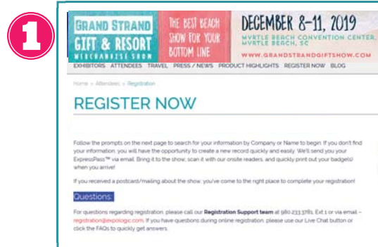
Registration Landing Page

Exclusive PRE-SHOW BRANDING opportunities